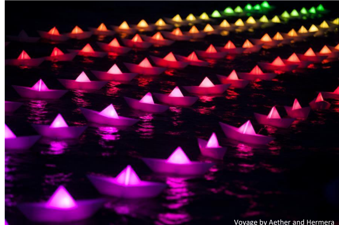
Voyage by Aether and Hermera

Performers and artists from diverse, cultural, gender, ability, LGBTQI and artistic backgrounds are encouraged to apply.