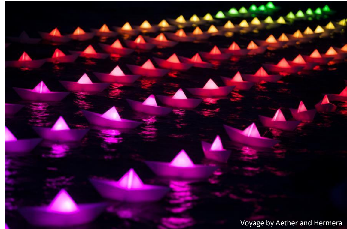
Voyage by Aether and Hermera

Performers and artists from diverse, cultural, gender, ability, LGBTQI and artistic backgrounds are encouraged to apply.