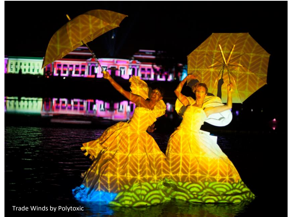
Trade Winds by Polytoxic

Due to budget considerations and to maximise the opportunity for the public to engage with numerous works and performances on site, the Festival will tend to assess lower to mid-price works more favourably than high cost works. If you have questions about the program budget, please contact entertainment@act.gov.au