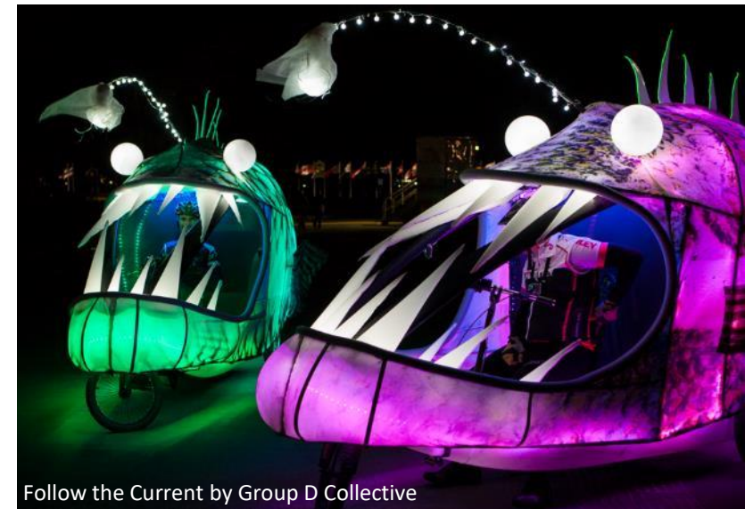
Follow the Current by Group D Collective