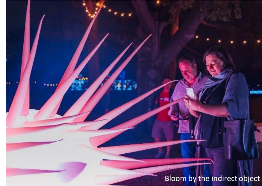
Bloom by the indirect object