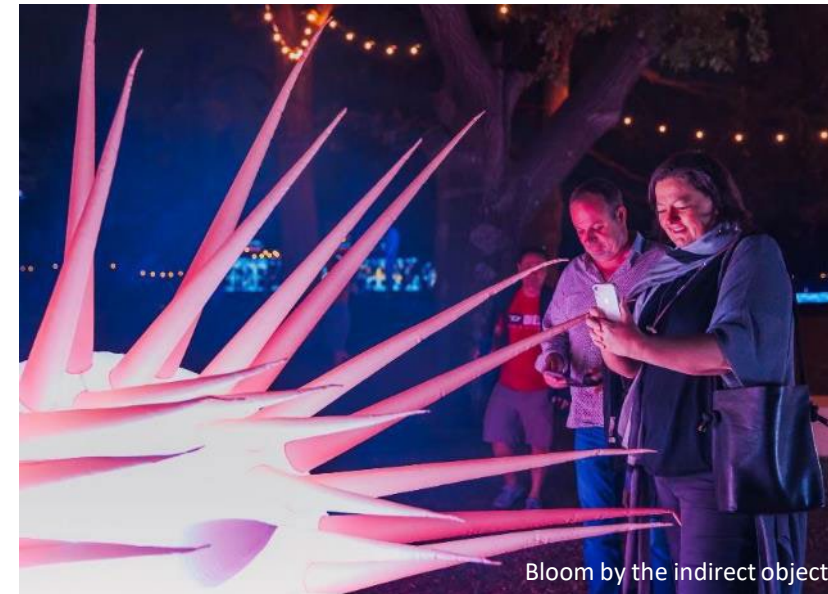
Bloom by the indirect object